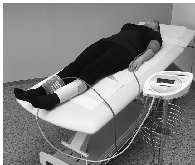
Figure 1 Picture of the MESI ABPI MD ® (MESI d.o.o., Ljubljana, Slovenia) device.

Measurement of ABI by means of Doppler probe method (ABI dop ) was performed according to the standard protocol 9 with a calibrated sphygmomanometer and 8 MHz Doppler probes (Dopplex SD2, Huntleigh Healthcare Ltd, Cardiff, UK). ABI dop was calculated as the ratio of the highest systolic blood pressure (SBP) obtained from both tibial and dorsalis pedis arteries at one ankle to the highest SBP of both brachial arteries. ABI dop_L refers to ABI values obtained on the left leg, ABI dop_R on the right leg. Measurement of ABI (ABI mes ) with the improved automated oscillometric device (MESI ABPI MD; Figure 1) was performed according to the manufacturer's instructions. In short, MESI ABPI MD system is based on simultaneous plethysmographic measurements through three cuffs, one conical cuff placed on the right or left arm, and two conical cuffs placed on each of the ankles. Precisely regulated system inflated and then deflated the three cuffs simultaneously at the same pressure level. Heart beats create oscillations on the plethysmographic signals, which are used to calculate blood pressure values from the three limbs using specific proprietary algorithms for the ankle blood pressure determination. The ankle cuffs measure oscillometric signals over the whole ankle and hence the highest SBP of all arteries within the ankle is detected.